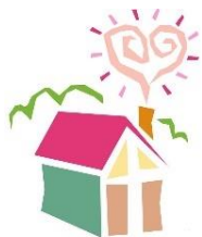
Home Heating Help

Many thanks to all who took a tag from the Giving Tree this year, making Christmas possible for 32 children at the Nashua Children's Home and two families at Marguerite's place!