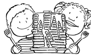
Pancakes ... YUM!