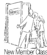
New Member Class