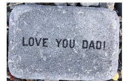
Example of 1-line text