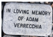
Example of 3-line text